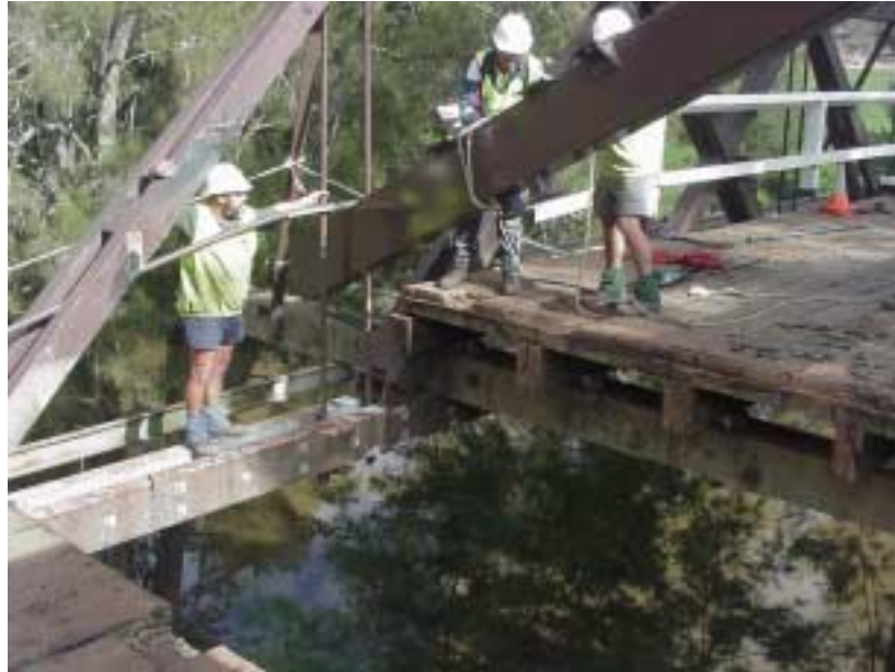
Figure 10: Installing New Steel Cross Girder on Truss Spans

A special steel cross girder was required at the main piers between trusses which was detailed to sit directly on the piers as shown in Figure 11 .