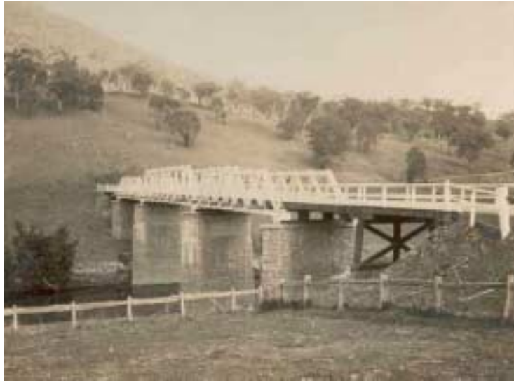
Figure 1: 1929 Photo of original bridge

The superstructure of this bridge was swept away by floodwaters on 5 th October 1916, though the stone piers remained undamaged. A low level bridge was built further downstream as a temporary measure, until such time as a new bridge could be built in the original location [2] .