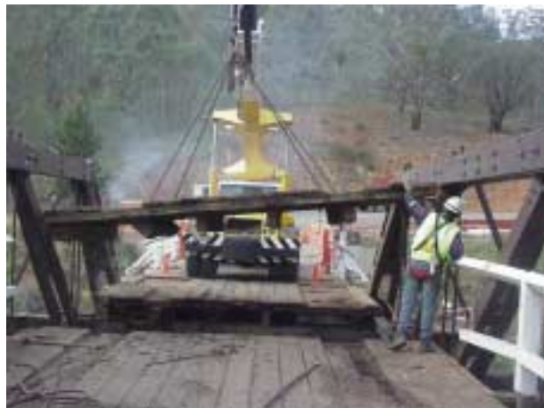
Figure 9: Removal of Old Decking on Truss Spans

It should be noted that all of the component sizes including the old deck and new SLT panels were sized to facilitate the use of single 16 tonne Franna crane.