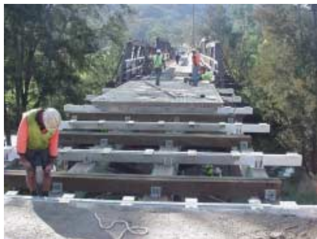
Figure 8: Abercrombie Approach Span Rehabilitation

The new timber and steel cross beams were then placed and secured as shown in Figure 8 . This photograph also displays the first of the two SLT deck panels that make up the deck for the two girder spans. A view of the completed approach span was previously shown in Figure 6 .