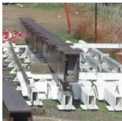
Figure: 4: Steel Cross Girder for Truss Spans

Steel cross girders were required in the truss spans due to the inherent under-capacity of the traditional timber cross girders to carry today's loadings as well as the difficulty in detailing a post connection to timber which satisfies the required traffic barrier capacity. The steel cross girders in the truss spans were made by welding two 380 PFC's together to form a 380 x 200 rectangular section as displayed in Figure: 4 . The latter simulated rectangular timber members in order to support heritage requirements.