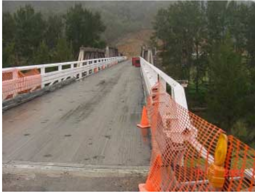
Figure 6: Completed Refurbishment Prior to Paving