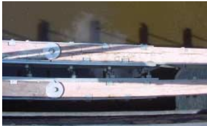
Figure 2: Steel plate reinforcement of bottom truss chords

The product of the modulus of elasticity and cross sectional area (EA) of the steel strengthening plates ( Figure 2 ) match the EA of the timber section and thus achieve strain compatibility. The introduction of the plates, therefore, effectively doubles the capacity of the bottom chord and if a timber flitch fails the steel alone will still be able to carry full T44 loading.