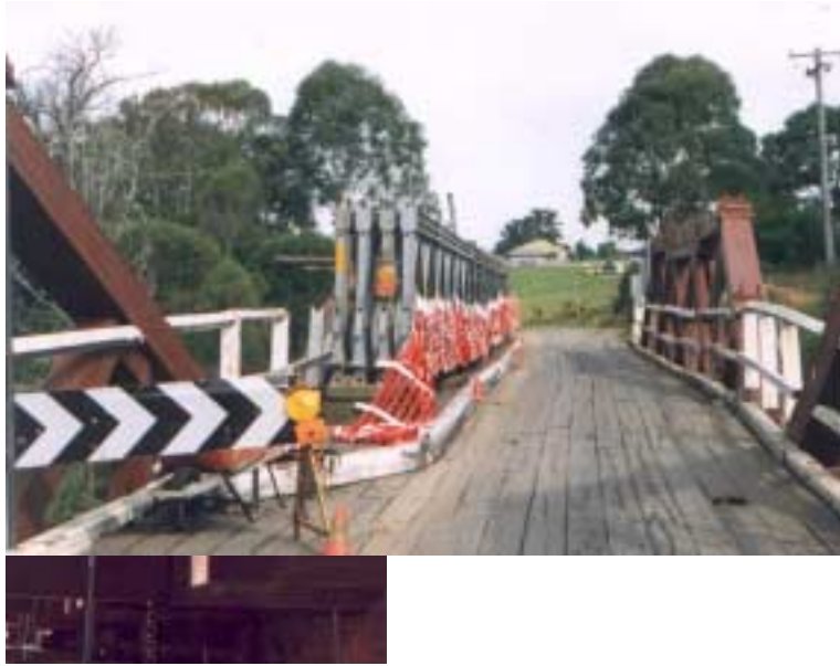
Figure 7: Typical Truss Support using Bailey Trusses at Clarence Town