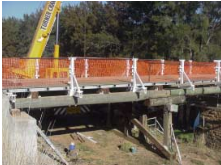
Figure 3: Typical approach span refurbishment

Steel cross girders were provided at barrier post location only and extend outside the deck to allow typical post backstays to be provided over the full length of the structure. Back stays are required to allow the use of posts equivalent in section to the original ordinance posts while meeting the strength required. These steel cross beams use RHS sections as shown in Figure 3 to simulate rectangular timber members in order to support heritage requirements.