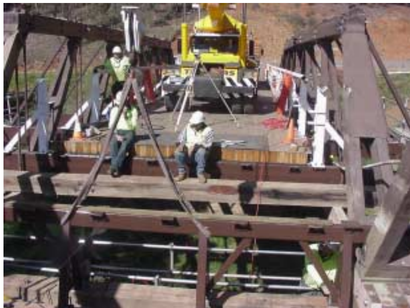
Figure 11: Special Cross Girder over Main Piers

A special steel cross girder was required at the main piers between trusses which was detailed to sit directly on the piers as shown in Figure 11 .