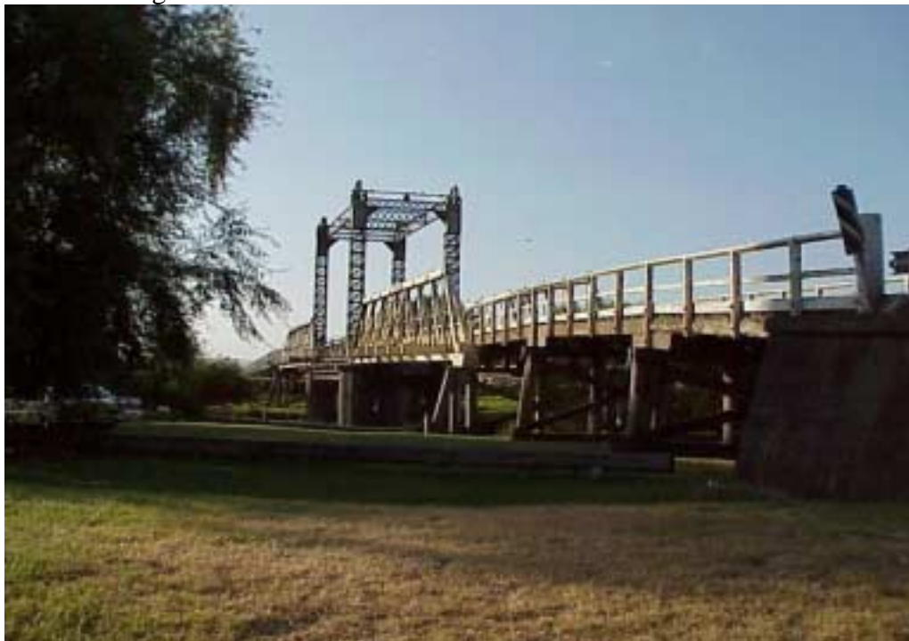
Figure 1: Hinton Bridge

The strategy proposed for the strengthening and rehabilitation of the Hinton Bridge is an example of a heritage sympathetic solution that preserves a State Heritage significant Bridge under current loadings.